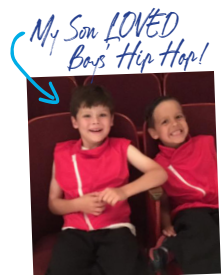
My Son LOVED Boys Hip Hop!