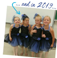
... and in 2019...