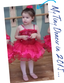
My First Dancer in 2015...